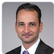
By Chris van Heerden Finance Practice Group Director

At the cusp of a new decade, the flood of capital into private funds risks becoming too much of a good thing. None of this is news to astute FFF readers: Equity strategies in many cases face a “buy high” proposition given rich buyout target valuations while debt strategies operate in a flat forward curve matrix with uninspiring credit fundamentals. Bloomberg journalists again traversed this familiar terrain in an article earlier this week titled “‘Peak’ Private-Equity Fears Are Spreading Across Pension World.” The consensus: An ever-growing pile of money chasing a finite number of deals means lower future returns.